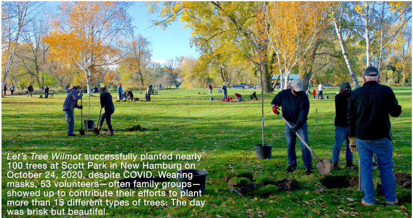
Let's Tree Wilmot successfully planted nearly 100 trees at Scott Park in New Hamburg on October 24, 2020, despite COVID. Wearing masks, 53 volunteers — often family groups — showed up to contribute their efforts to plant more than 15 different types of trees. The day was brisk but beautiful.

Email letstreewilmot@gmail.com for details. For tree news, information and updates, go to www.facebook.com/letstreewilmot